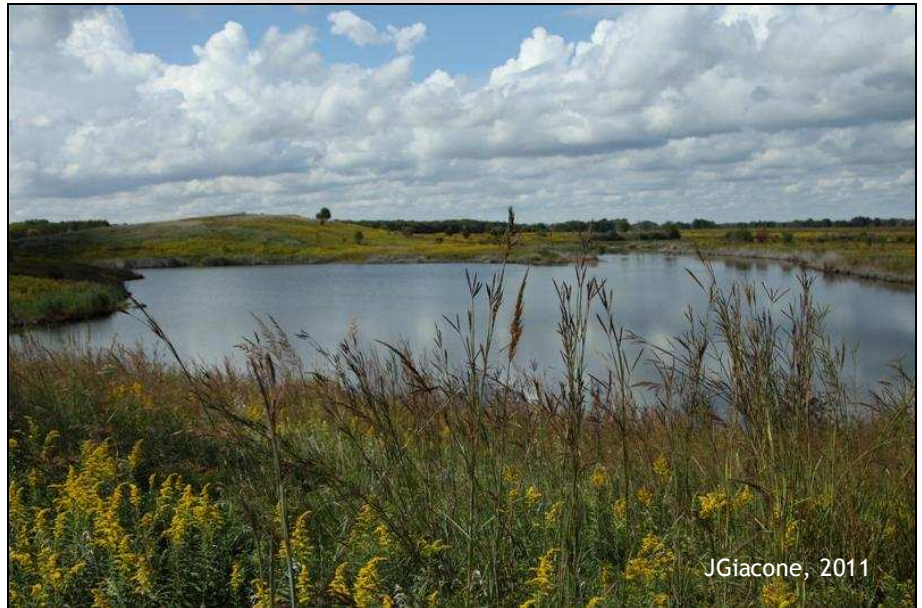
photo. The best place to view the expanse of color is on our observation deck at the visitor's center.