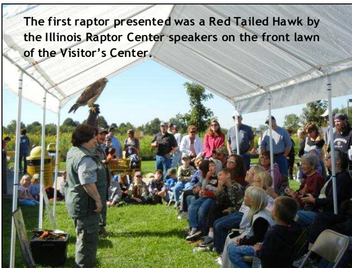
The first raptor presented was a Red Tailed Hawk by the Illinois Raptor Center speakers on the front lawn of the Visitor's Center.

The Illinois Raptor Center was outside of the building. The birds they had were just beautiful to see up close. Not just things of beauty, we learned that birds of prey play a big part in keeping our ecosystem in balance.