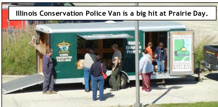
Illinois Conservation Police Van is a big hit at Prairie Day.

The Illinois Conservation Police were there with their mobile display of Illinois animals and educational information.