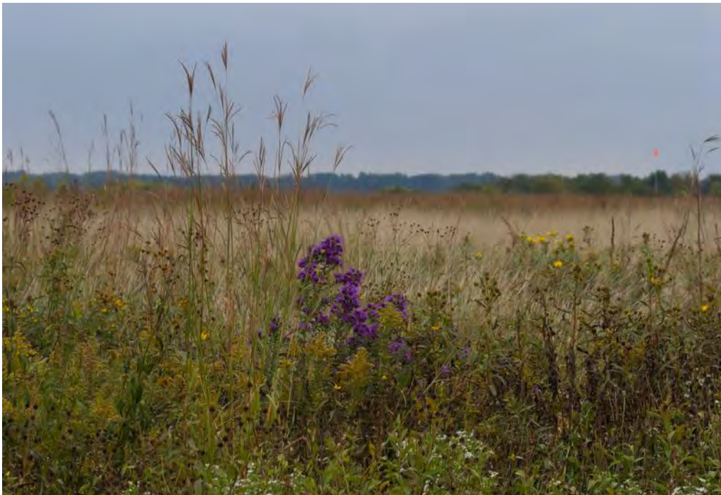
5010 N JUGTOWN ROAD, MORRIL, ILLINOIS