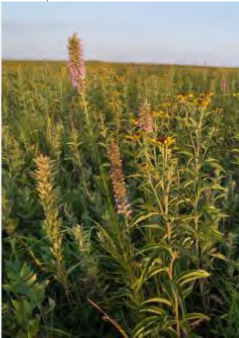
Taberville Prairie – north of Eldorado Springs, Missouri.

numbers of organisms, interacting at multiple levels, both visible and invisible to the human eye, above and below ground, shaping and in turn being shaped by the physical environment. To visit a prairie is to be immersed in the result of thousands of generations of competition and natural selection resulting in a dynamic array of diversity, which, collectively, is supremely attuned to this uniquely mid-continental landscape.