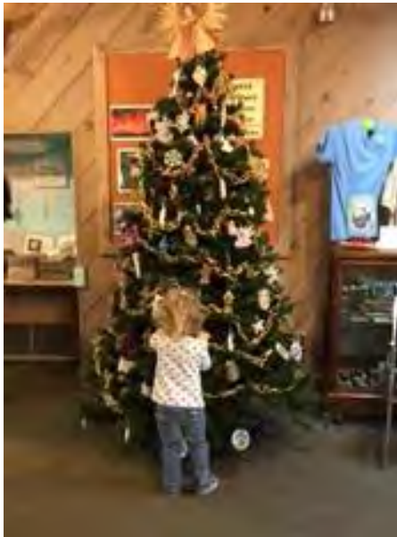
Putting finishing touches on our tree

Decorated by Partners and guests, our tree is a beautiful sight in the Visitors Center.