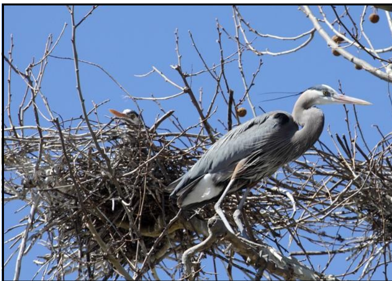
Blue Heron Nest by J. Giacone, 2012

See the website: http://gooselakeprairie.org for a full activity schedule for 2013.