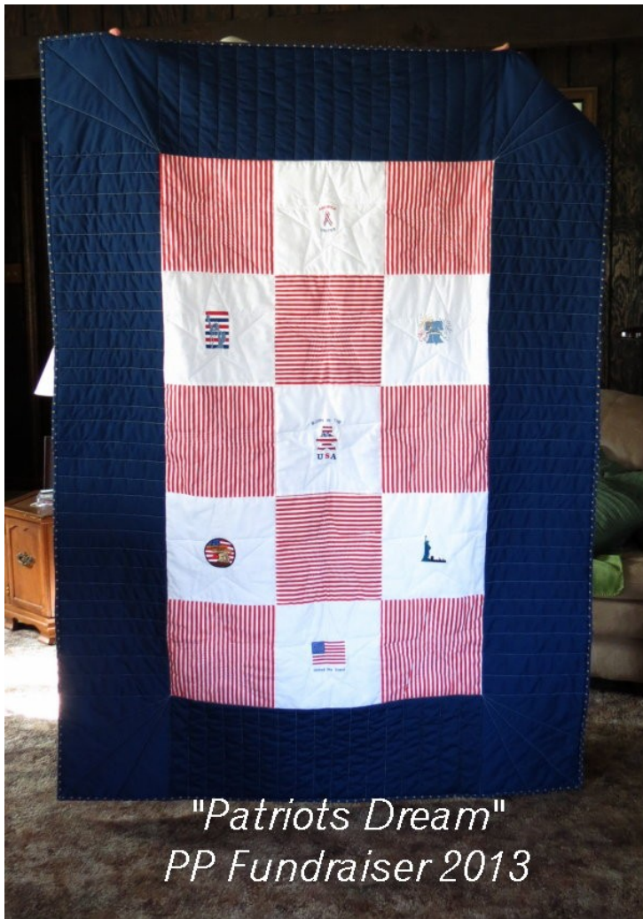
"Patriots Dream" PP Fundraiser 2013