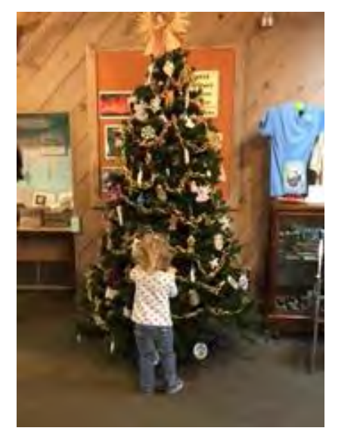
Putting finishing touches on our tree

Decorated by Partners and guests, our tree is a beautiful sight in the Visitors Center.