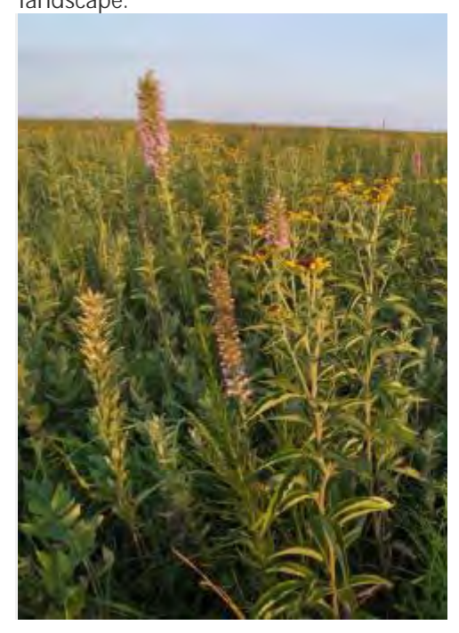
Taberville Prairie – north of Eldorado Springs, Missouri.