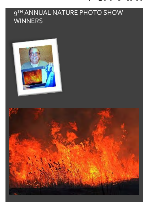
Best in Show and Best in Color - GLSPNA Burn 2015 By Rex Termain Braidwood, IL