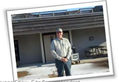
Goose Lake Prairie State Natural Area, Heidecke Lake and Morris Wetlands

Left: Homemade Goodies and Hot Apple Cider prepared by the Partners for the day