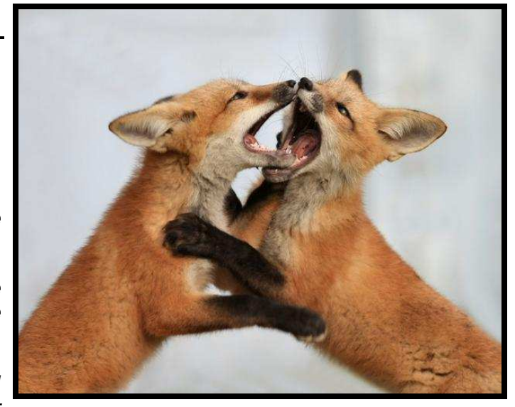
2011 People's Choice:

Instructions & entry forms are on our website: <a href="http://gooselakeprairie.org">http://gooselakeprairie.org</a>